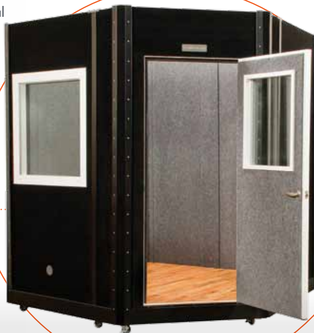
Custom 14 Carat Platinum Diamond Series VocalBooth™

Add a window for a clear view to your engineer or for just additional light. The Vent Silencer upgrade reduces the already quiet ventilation to a minimum for superior voice casting.