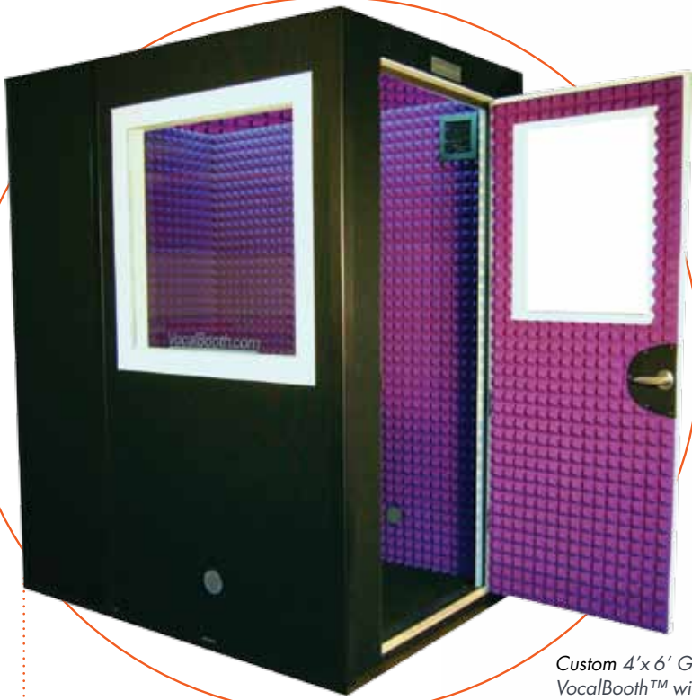
Custom 4' x 6' Gold Series VocalBooth™ with Auralex

Shhhhhh. Quiet please. You've said that a million times, right? Not anymore when you have a VocalBooth™. Whether your sound reduction needs are for scientific testing, super secret conferencing or your new audiology office our VocalBooths™ are designed to do the job you need. We have provided booths for an array of businesses and institutions, including government agencies, churches and universities in the US and abroad. The applications are as diverse as our client list. We've had clients purchase a VocalBooth™ just to get some shut-eye. (Those tend to be the ones in the heart of Manhattan.)