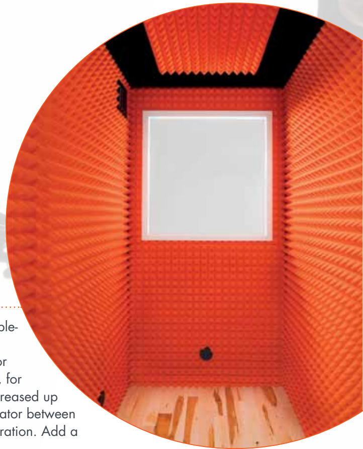
Custom 4'x6' Platinum Series VocalBooth™ with Auralex

Recommended for those who want significant sound isolation, the double-wall VB Platinum Series™ with acoustic fabric wrapped interior is our premium sound reduction VocalBooth™. Choose the size you need—for vocals a 4'x6' may be right but to give you the elbow room you need, for multiple musicians or a full drum set, the VB Platinum Series can be increased up to a 16'x16'. The VB Platinum Series' unique sub-floor acts as a separator between the booth and the preexisting room for reduced low frequency reverberation. Add a window for clear communication between talent and engineer.