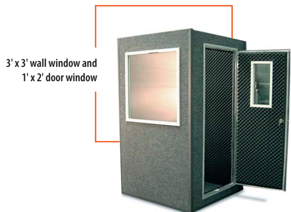
VB Silver Series™ 4' x 4'

Please note: All windows are considered optional accessories, as well as caster wheels and a vent silencer upgrade which is recommended for recording applications.